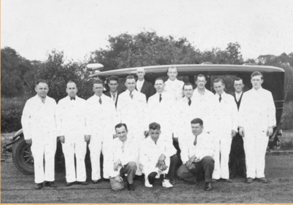
In 1937, founding ambulance corps members pose in front of their first vehicle, a 1926 REO ambulance.