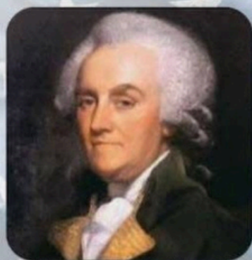
NJ Governor William Franklin 1730-1813