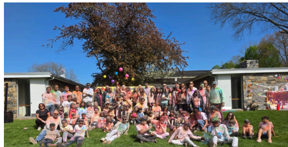
The Indian Cultural Association of Allendale celebrated the arrival of spring with their annual Holi Festival on April 26.