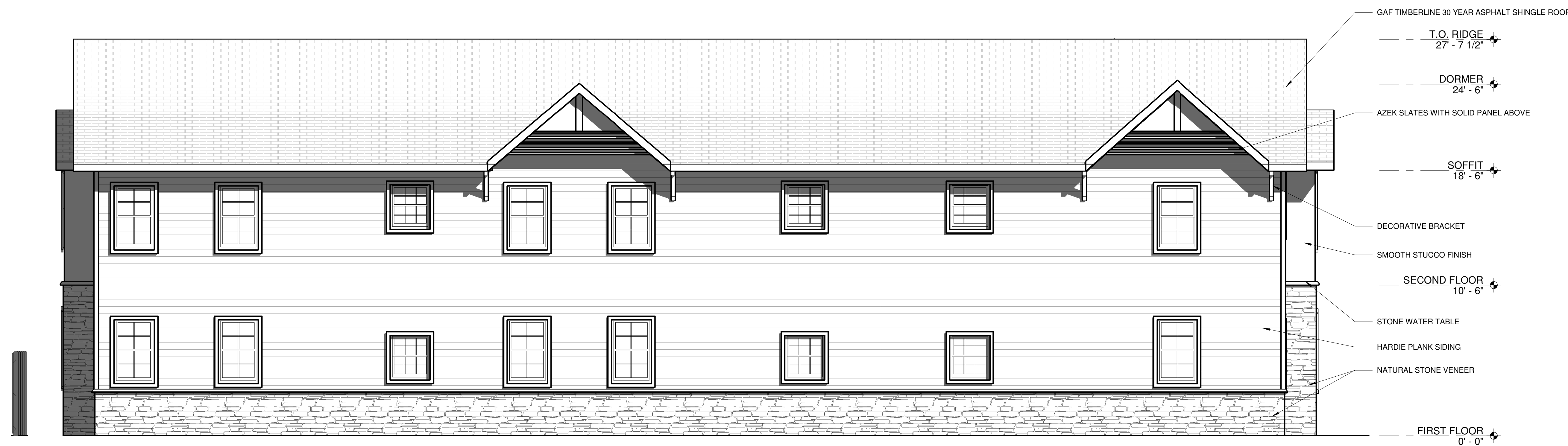
② REAR ELEVATION 1/4" = 1'-0"