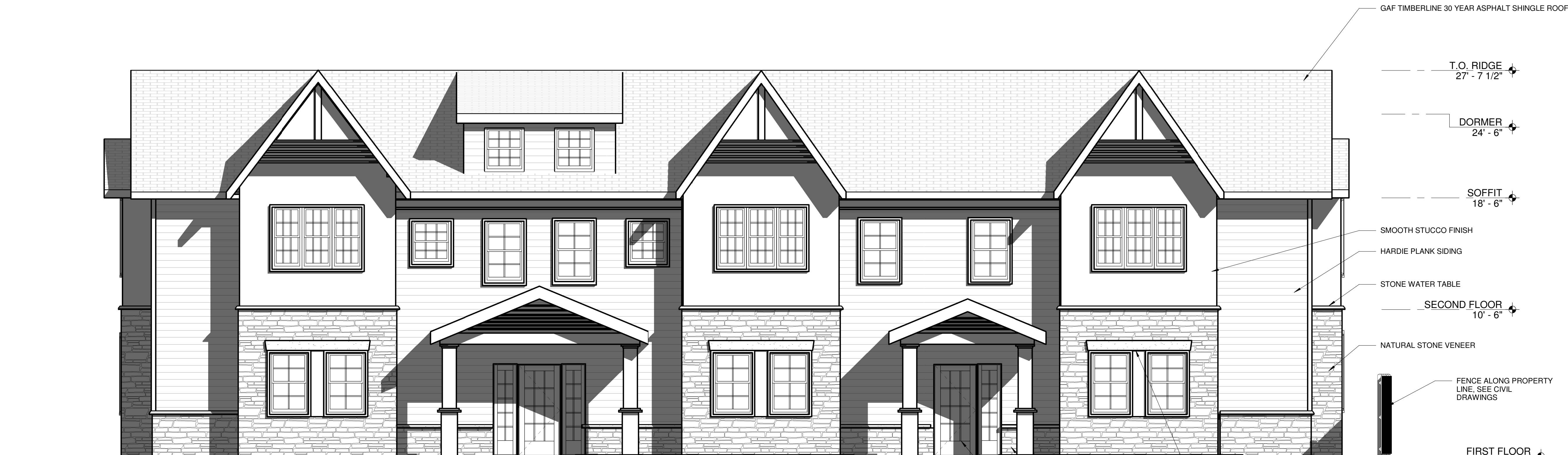
① FRONT ELEVATION 1/4" = 1'-0"