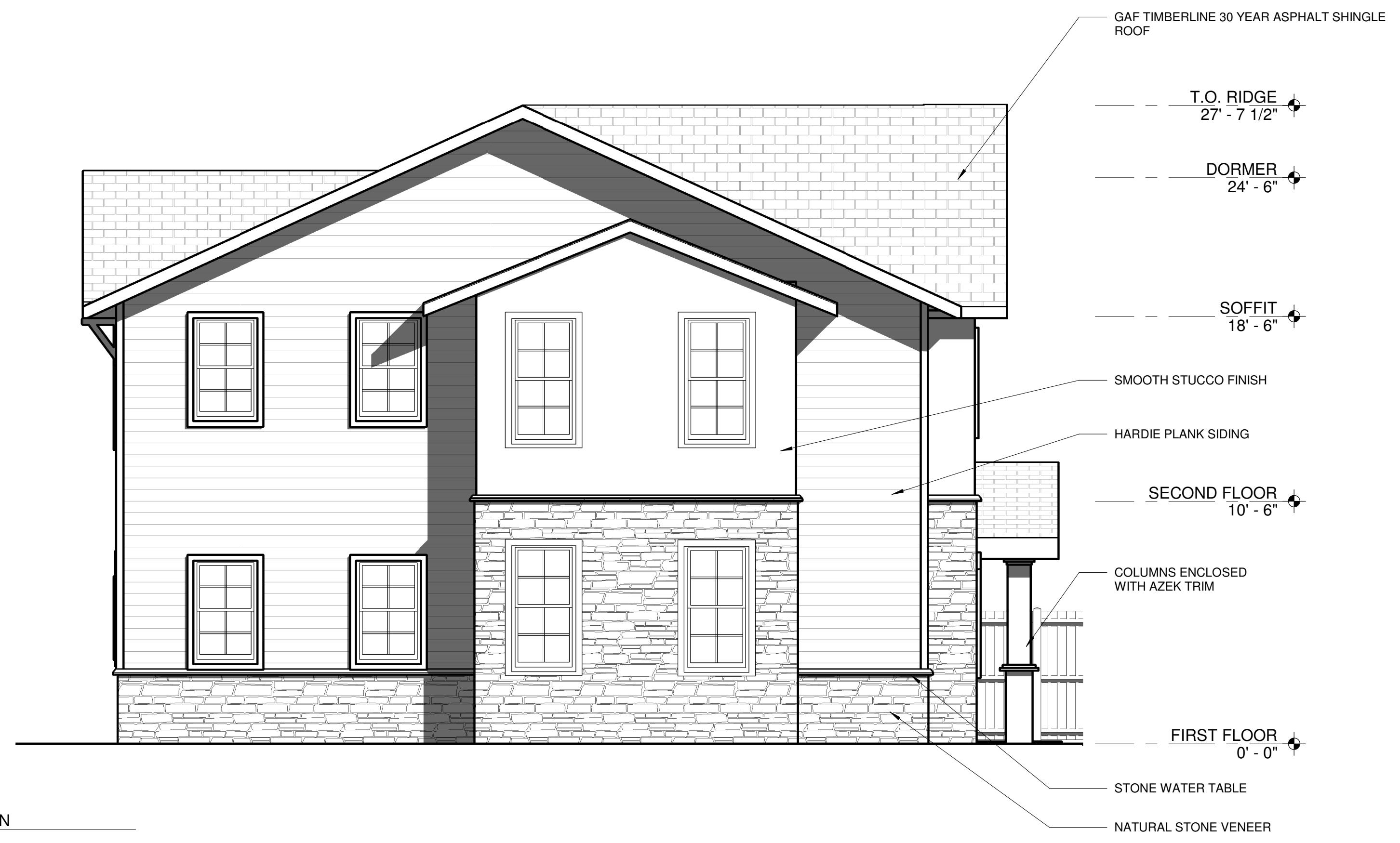
① STREET ELEVATION 1/4" = 1'-0"