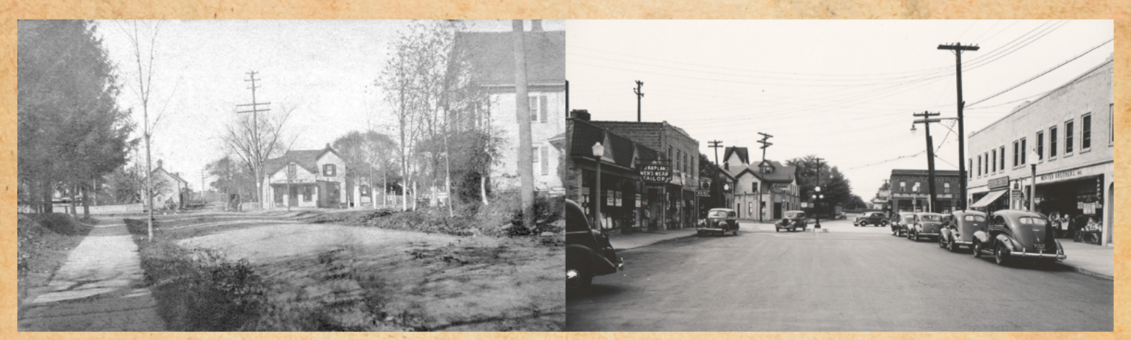
1906 postcard of West Allendale Avenue, looking west.

In more recent times, West Allendale Avenue has gone through several streetscape upgrades. In 1990, the council approved a makeover of the West Allendale Avenue shopping district to include paver sidewalks, additional parking, updated lighting, and removal of aboveground utility poles and wires. On June 16, 1992, the Allendale borough clock honoring Mayor Clarence "Curly" Shaw's effort to revitalize the shopping district was installed in the traffic island that intersects Myrtle and West Allendale Avenues. During 2020–2021, aided by $662,000 in Department of Transportation streetscape grants, the business district was refreshed with new, richly colored pavers, trees, and traditional-style light posts, all chosen to create a classic and timeless look.